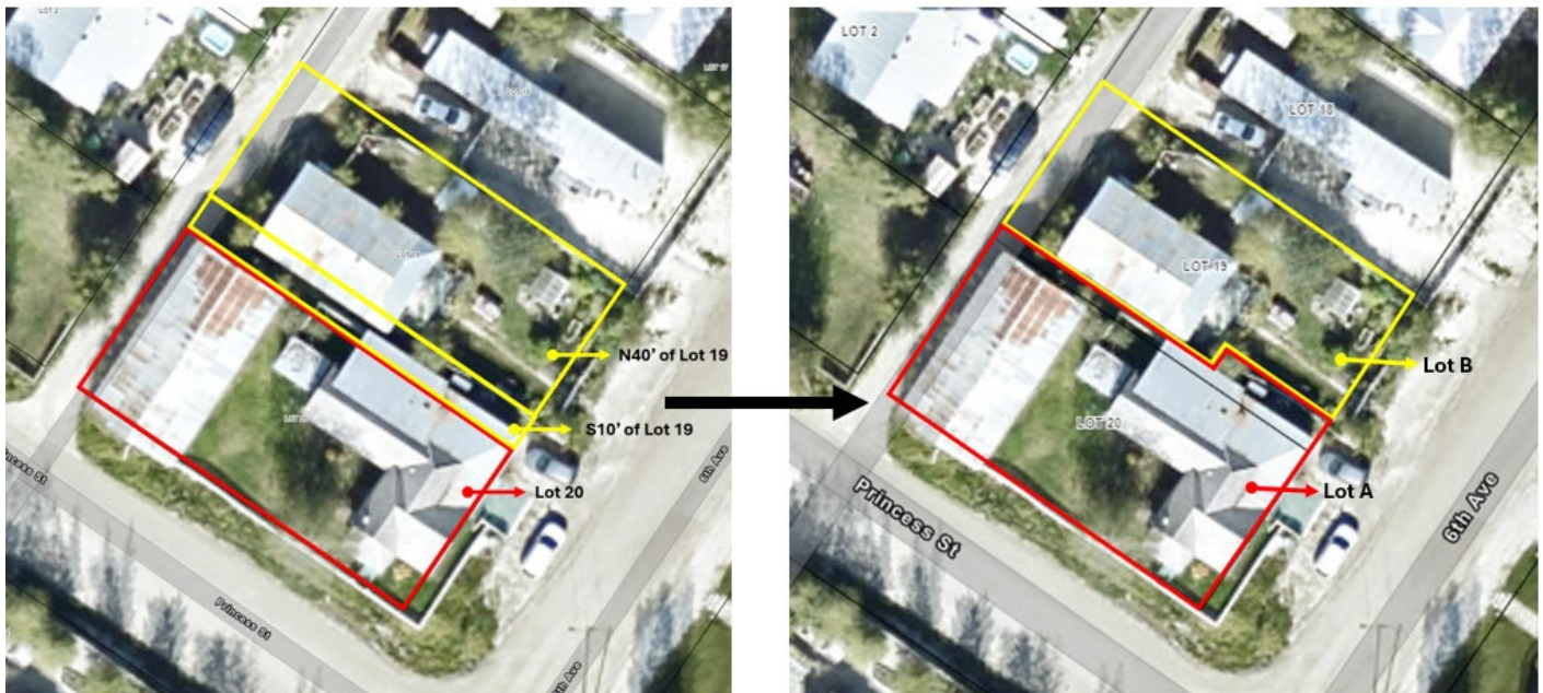
Figure 1 : DP #24-059